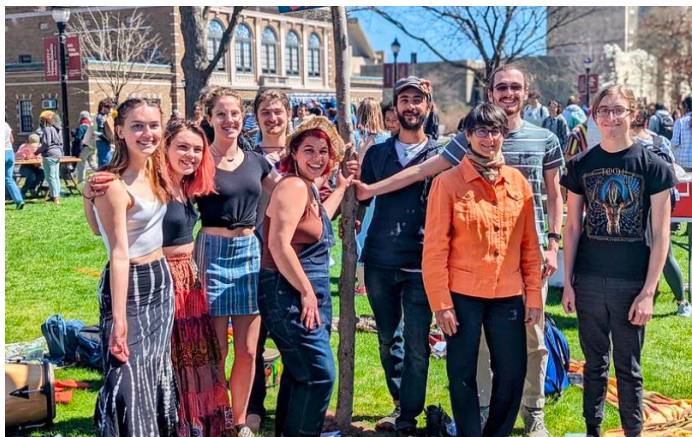
Organizers and participants at the 2022 Earth Day Extravaganza

That energy continued right into our Fall market season. We had 83 different student vendors, organizations, and student groups table during our 8-week Fall season. That diversity led to our strongest attendance ever, with most markets seeing at least 300 visitors. Several local publications including the Daily Collegian and Amherst Wire took note of this interest and featured the market with headlines such as “UMass Student Farmer’s Market Emphasizes Community and Sustainability” .