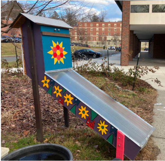
Our new solar dehydrator, built in collaboration with the Makerspace and an environmental conservation class

We offered 18 class and community tours of our gardens with a total of 240 participants .