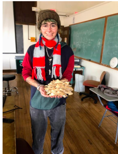
A practicum student holding some oyster mushrooms grown on cardboard and coffee