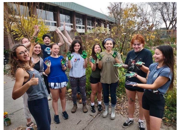
Volunteers celebrate a great season with some hand stamps

We recognize the need to widen our doors and strengthen our mycelial web so that the entire campus ecosystem benefits from our work. With that in mind, we're also busy cultivating additional community partners who want to access our living laboratory of sustainability, regeneration, and resilience. We hope you'll come by for a visit, reach out with your ideas, and continue to support our growth.