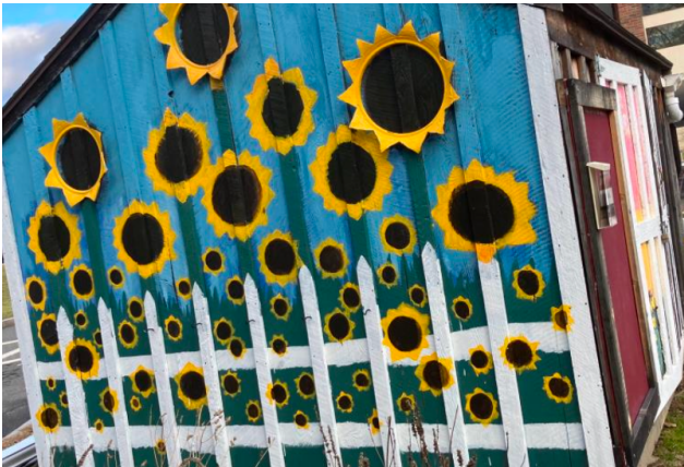
New mural painted by a student in the practicum course

- Anonymous, found in the Garden Journal