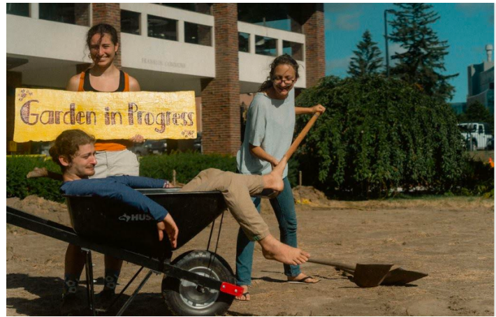
Summer gardeners working on the new “Franklin East” Garden

One of our proudest achievements of 2022 was officially breaking ground on the expansion of the Franklin Garden, colloquially called the “Frank East Garden”. Beginning in August 2022, we began turning an underutilized lawn into a handicap-accessible raised bed garden that will significantly expand our capacity to educate and grow food for the community.