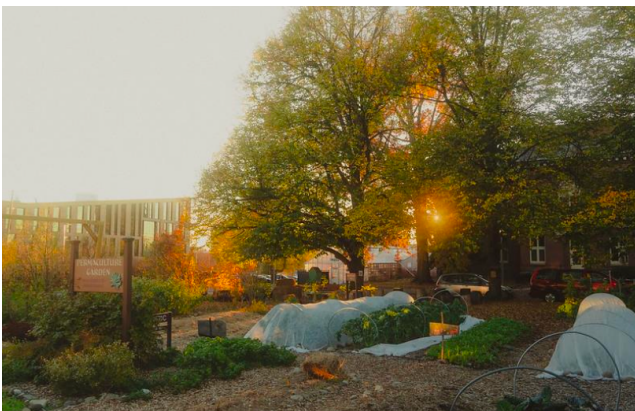
Sunset in the Franklin Garden