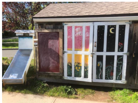
Shed mural and new solar dehydrator

Our food was utilized throughout UMass Dining and the greater community. The lion's share, 530 lbs., was sold through the farmers' market where we offer students our fresh and value-added products at reasonable prices. The new restaurant in Worcester DC, Commonwealth kitchen, received 120 lbs. of high-value baby greens and microgreens. We also donated 150 lbs. to the Amherst Survival Center.