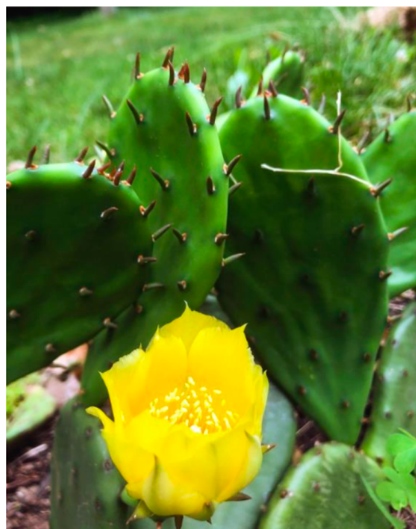
Prickly Pear Cactus in bloom