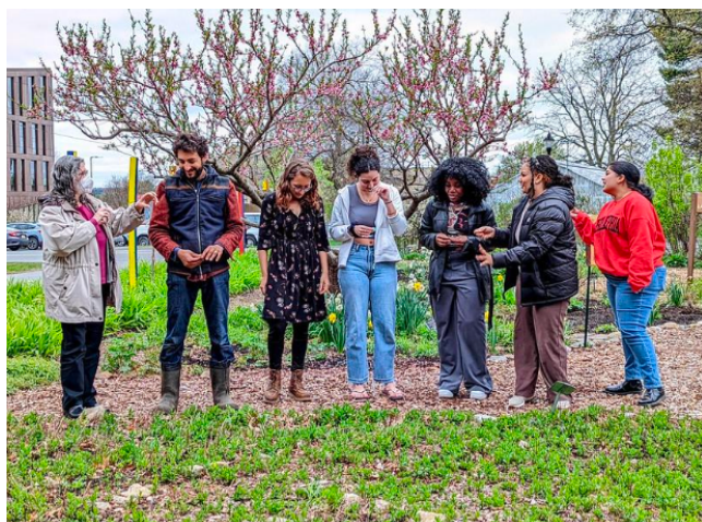
Participants from the Women of Color Leadership Network on a tour of the garden