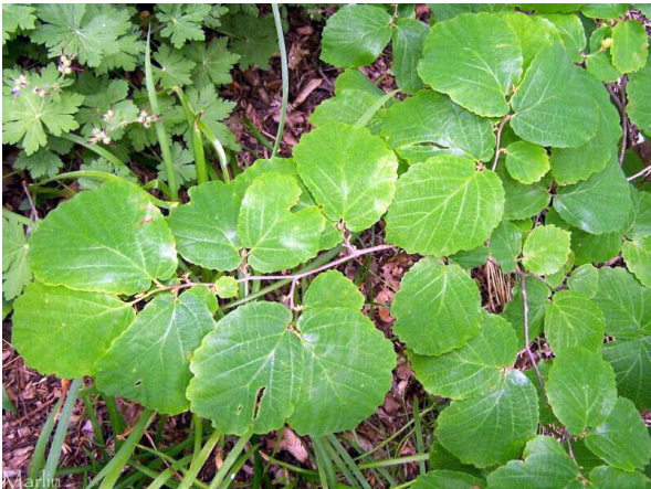
Witch Hazel leaves are rounded and tend to grow in a way where they create their own canopy in the lower levels of a forest

Witch Hazel: Some people apply witch hazel directly to the skin for itching, pain and swelling (inflammation), eye inflammation, skin injury, mucous membrane inflammation, vaginal dryness after menopause, varicose veins, hemorrhoids, bruises, insect bites, minor burns, acne, sensitive scalp, and other skin irritations.