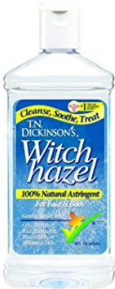
Store-bought Witch Hazel is a liquid that is distilled from dried leaves, bark, and partially dormant twigs of witch hazel